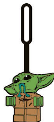
52974 LEGO® STAR WARS™ THE MANDALORIAN™ Bag Tag GROGU™ Yum Yum