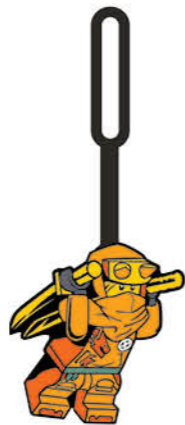
53341 LEGO® NINJAGO® Bag Tag Arin