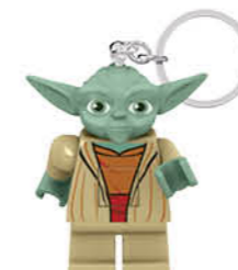
KE11H LEGO® STAR WARS™ Key Light YODA™