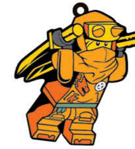
53346 LEGO® NINJAGO® Magnet Arin