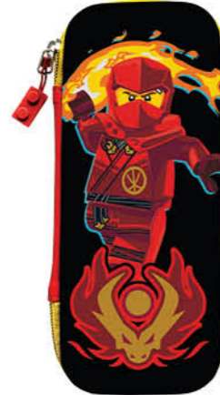
53325 LEGO® NINJAGO® Molded Pencil Case