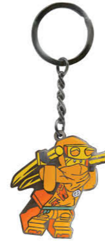
53336 LEGO® NINJAGO® Enamel Keychain Arin