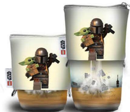
53320 LEGO® STAR WARS™ THE MANDALORIAN™ Pencil Case Pop Up Jet Pack