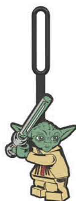
52222 LEGO® STAR WARS™ Bag Tag YODA™

**KE208HA has possible limitations and operates on 2 x CR12253V batteries.