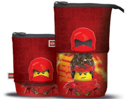
53460 LEGO® NINJAGO® Pencil Case Pop Up Kai