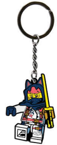
53340 LEGO® NINJAGO® Bag Tag Sora