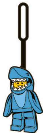
52540 LEGO® Minifigures™ Bag Tag Shark Suit Guy