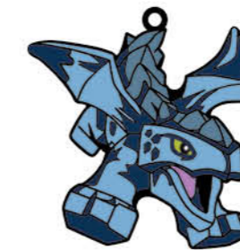
53349 LEGO® NINJAGO® Magnet Riyu