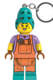
KE225H LEGO® Minifigures™ Keychain Light Potter