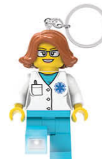
KE185H LEGO® City Keychain Light Female Doctor