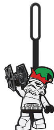
52479 LEGO® STAR WARS™ Bag Tag STORMTROOPER™ Holiday