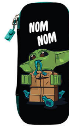
53345 LEGO® STAR WARS™ THE MANDALORIAN™ Molded Pencil Case GROGU™ Nom