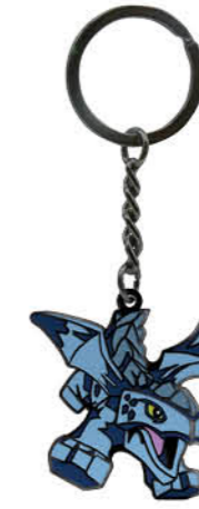
53339 LEGO® NINJAGO® Bag Tag Riyu