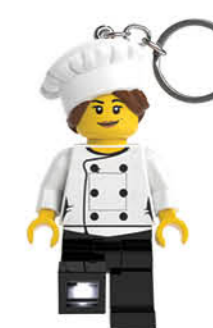
KE218H LEGO® Minifigures™ Keychain Light Gourmet Chef