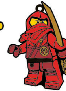
53347 LEGO® NINJAGO® Magnet Kai