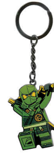
53338 LEGO® NINJAGO® Enamel Keychain Lloyd