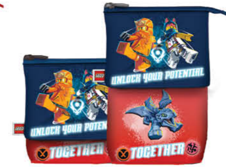
53345 LEGO® NINJAGO® Pencil Case Pop Up Together