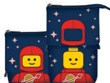
53434 LEGO® Minifigures™ Pencil Case Pop Up Spaceman Red