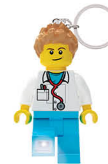
KE184H LEGO® City Keychain Light Male Doctor