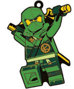
53348 LEGO® NINJAGO® Magnet Lloyd