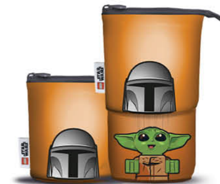
53459 LEGO® STAR WARS™ THE MANDALORIAN™ Pencil Case Pop Up