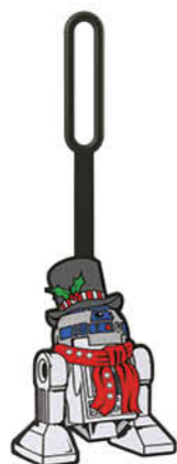
52482 LEGO® STAR WARS™ Bag Tag R2-D2™ Holiday