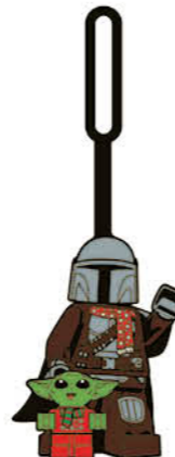
53352 LEGO® STAR WARS™ THE MANDALORIAN™ Bag Tag Holiday