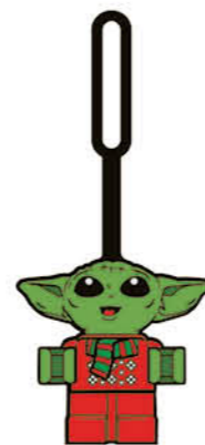
53351 LEGO® STAR WARS™ THE MANDALORIAN™ Bag Tag GROGU™ Holiday