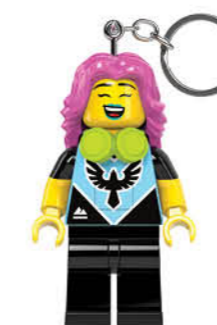
KE229H LEGO® Minifigures™ Keychain Light Esports Girl