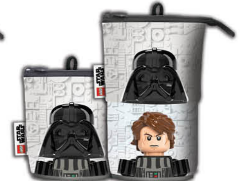
53461 LEGO® STAR WARS™ Pencil Case Pop Up STORMTROOPER™/HAN SOLO™