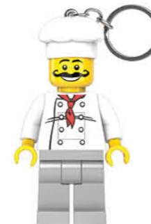
KE24H LEGO® Minifigures™ Keychain Light Chef