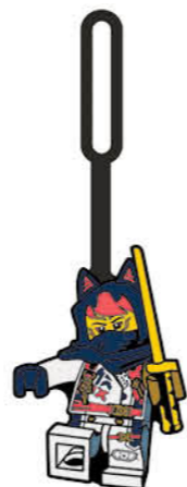
53345 LEGO® NINJAGO® Bag Tag Sora