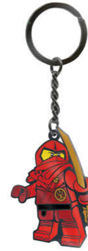
53337 LEGO® NINJAGO® Enamel Keychain Kai