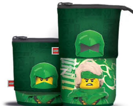
53518 LEGO® NINJAGO® Pencil Case Pop Up Lloyd