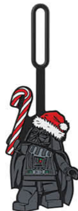
52478 LEGO® STAR WARS™ Bag Tag DARTH VADER™ Holiday