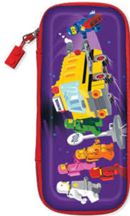
53500 LEGO® Minifigures™ Molded Pencil Case Spacebus