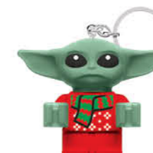
**KE208AH LEGO® STAR WARS™ THE MANDALORIAN™ Key Light GROGU™ Holiday Sweater