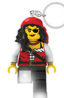
KE193H LEGO® Minifigures™ Keychain Light Pirate Princess