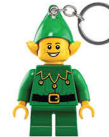
KE181H LEGO® Minifigures™ Keychain Light Holiday Elf