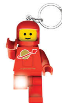
KE10HR LEGO® Minifigures™ Keychain Light Spaceman Red