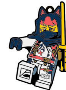
53350 LEGO® NINJAGO® Magnet Sora