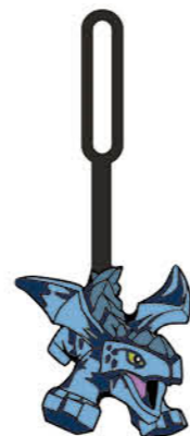
53344 LEGO® NINJAGO® Bag Tag Riyu