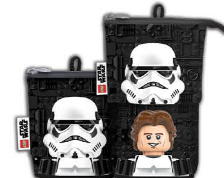
53458 LEGO® STAR WARS™ Pencil Case Pop Up DARTH VADER™/ANAKIN SKYWALKER™