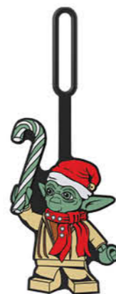
52480 LEGO® STAR WARS™ Bag Tag YODA™ Holiday