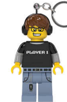
KE217H LEGO® Minifigures™ Keychain Light Video Game Guy