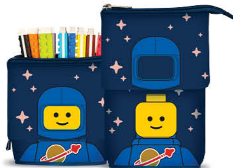
53389 LEGO® Minifigures™ Pencil Case Pop Up Spaceman Blue