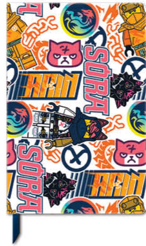
53300 LEGO® NINJAGO® Notebook