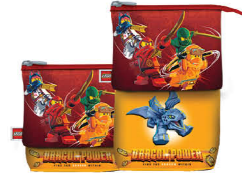
53323 LEGO® NINJAGO® Pencil Case Pop Up Dragon Power