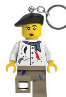
KE216H LEGO® Minifigures™ Keychain Light Artist