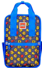
LEGO®, Heads and Cups/Blue 20127-1933