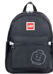
LEGO®, Emoji/Black 20129-1968