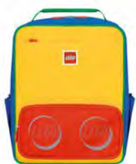
LEGO®, Corporate Red 20134-1948