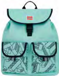
LEGO®, Outlined Bricks - Mint/Black 20132-1943

Reflective elements on all four sides of the bag