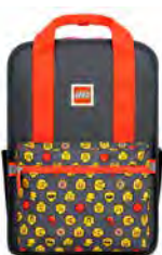
LEGO®, Heads and Cups/Red 20128-1932