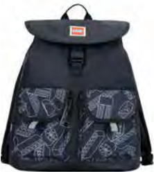
LEGO®, Outlined Bricks - Black/Grey 20132-1939

Dimensions: H39 x W32 x D16 cm Weight: 390 g Volume: 16 ltr Material: Polyester Dobby