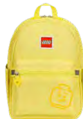
LEGO®, Emoji/ Pastel Yellow 20129-1937