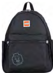
LEGO®, Emoji/Black 20130-1968