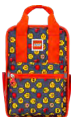
LEGO®, Heads and Cups/Red 20127-1932