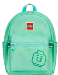
LEGO®, Emoji/ Pastel Mint 20129-1938

Dimensions: H29 x W22 x D10 cm Weight: 245 g Volume: 7 ltr Material: Polyester Twill