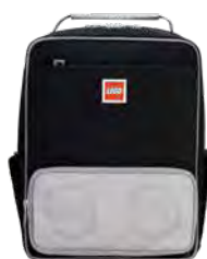
LEGO®, Grey 20134-1952