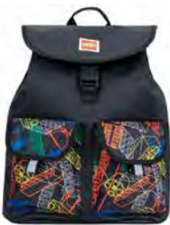
LEGO®, Outlined Bricks - Black/Multi 20132-1942