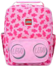
LEGO®, Filled Minifigure - Pink 20133-1945