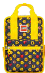
LEGO®, Heads and Cups/Yellow 20127-1934