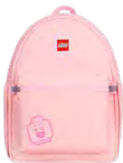
LEGO®, Emoji/ Pastel Pink 20130-1935