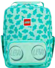
LEGO®, Filled Minifigure - Mint 20133-1944