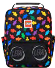
LEGO®, Filled Minifigure - Multi 20133-1946