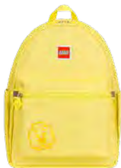
LEGO®, Emoji/ Pastel Yellow 20130-1937