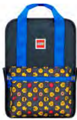
LEGO®, Heads and Cups/Blue 20128-1933