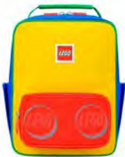
LEGO®, Corporate Red 20133-1948