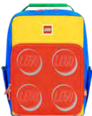
LEGO®, Corporate Red 20135-1948