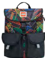
LEGO®, Outlined Bricks - Black/Multi 20131-1942

Reflective elements on all four sides of the bag