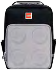
LEGO®, Grey 20135-1952