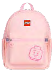
LEGO®, Emoji/ Pastel Pink 20129-1935