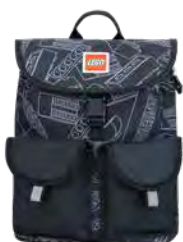
LEGO®, Outlined Bricks - Black/Grey 20131-1939

Dimensions: H31 x W24 x D10.5 cm Weight: 295 g Volume: 7 ltr Material: Polyester Dobby