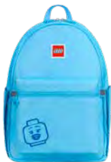
LEGO®, Emoji/ Pastel Blue 20130-1936