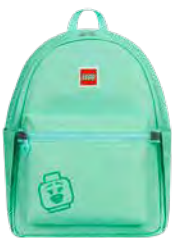
LEGO®, Emoji/ Pastel Mint 20130-1938