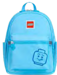
LEGO®, Emoji/ Pastel Blue 20129-1936