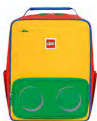
LEGO®, Corporate Green 20134-1951