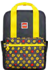
LEGO®, Heads and Cups/Yellow 20128-1934